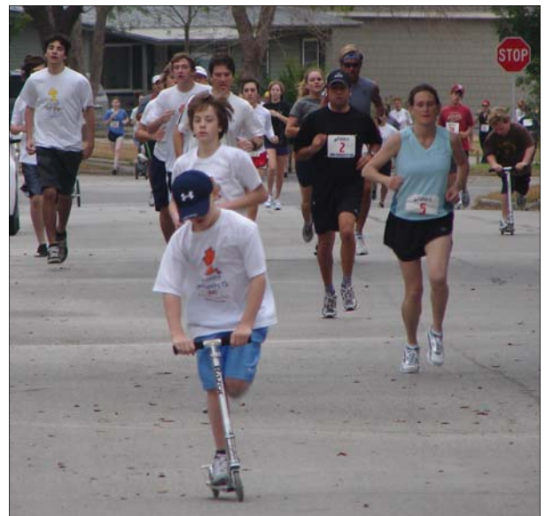
2008 Community Fun Run/Walk and Kid's Dash.