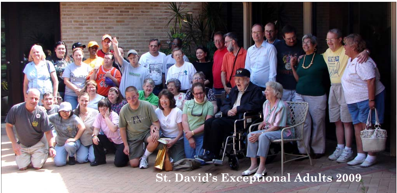
St. David's Exceptional Adults 2009