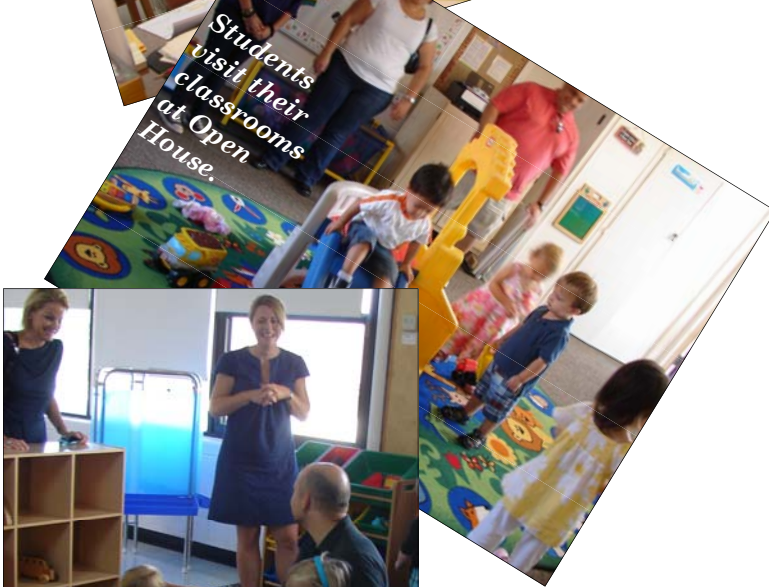
Students visit their classrooms at Open House.