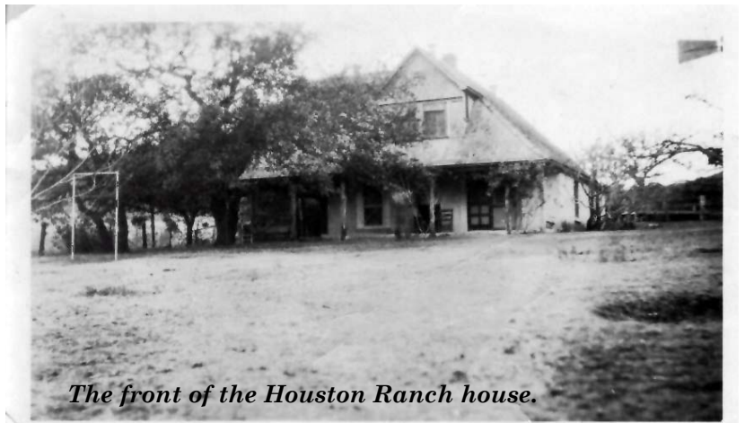
The front of the Houston Ranch house.

In those days, we were not cared for by babysitters; we were taken to our grandmother's house. I was there anytime my parents went out of town. My Grandma was my best friend.