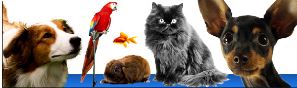
St. David's Pet Blessing Sunday, October 4 at 3:00 pm