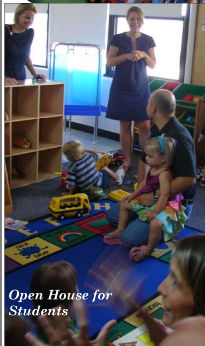
Open House for Students